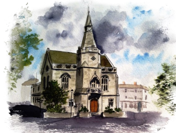
Banbury Town Hall