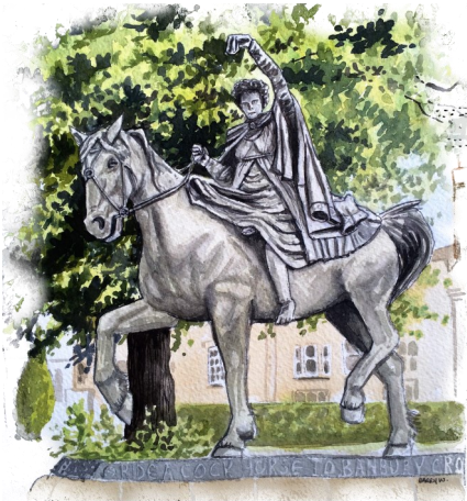
Fine Lady Statue