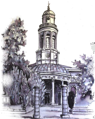
St Mary's Church